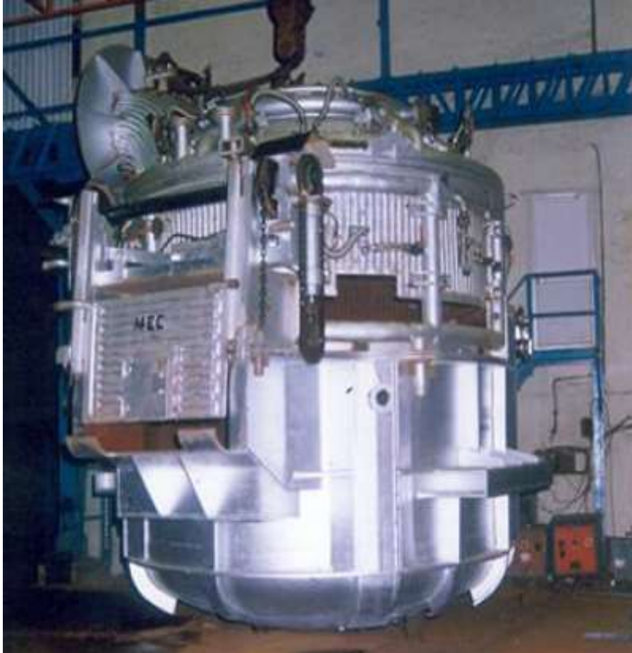
45 TON EAF ROOF , TOP SHELL & BOTTOM SHELL ASSY.