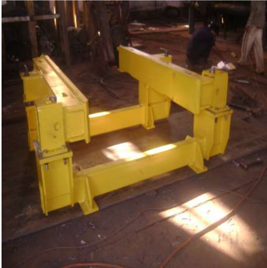
COOLING BED ARM