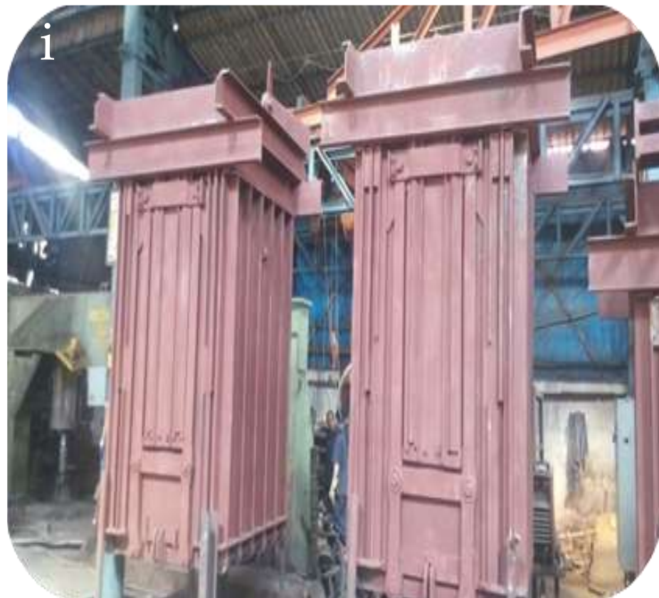
PLATE CHUTE FOR SINTER